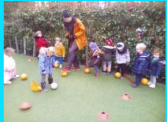
Playing football in the garden with Little Foxes Football Class.