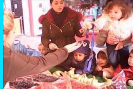
Pre-school room children on a fun trip to Portobello market buying fruit